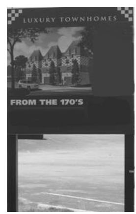
Off-Premise Real Estate